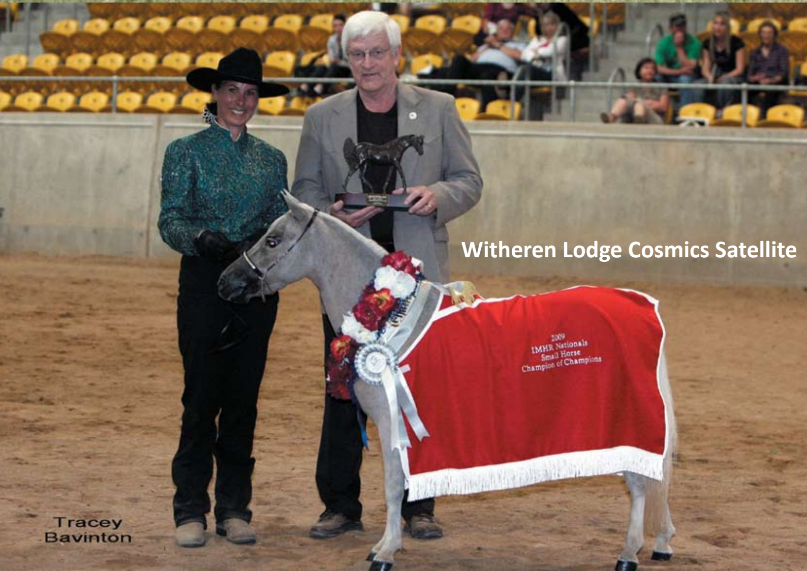
Witheren Lodge Cosmics Satellite

2009 IMHR Nationals Small Horse Champion of Champions