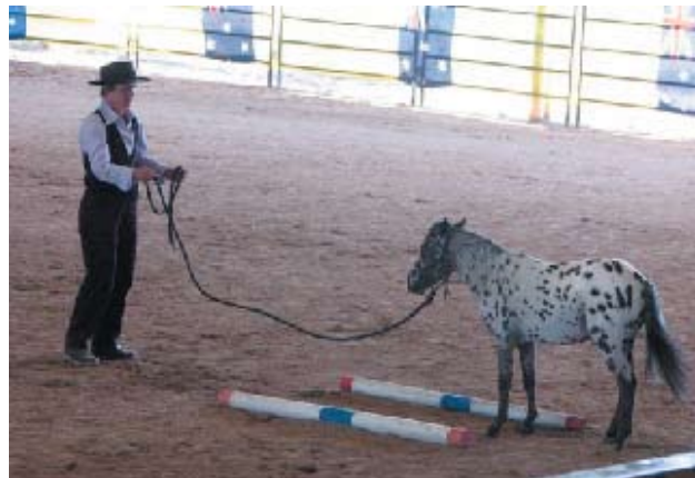
Coomba Smokey Joe In his first Trail Event at the IMHR Nationals 2008 Reserve Champion Small Horse Trail I was very proud of my handsome boy ☺

Light hands = Responsiveness | Heavy hands = Resistance